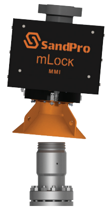
ALLOWS 5° MISALIGNMENT