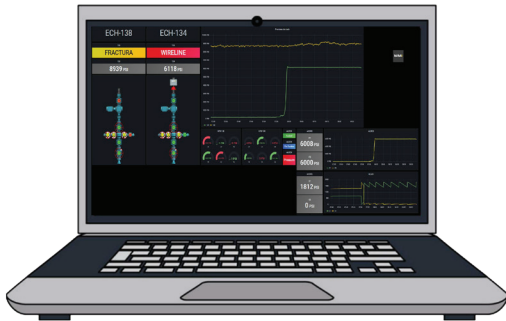
ONBOARD TELEMTRY WITH DATA TRACKING ANALYTICS