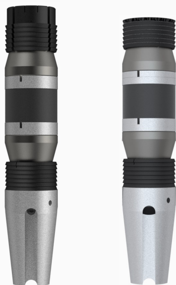
Mechanical Set Cement Retainer