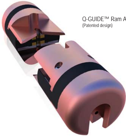
Q-GUIDE™ Ram Assembly (Patented design)

The Elmar Q-GUIDE™ ram is a proprietary patented design that provides a positive alignment for the wireline. V-shaped flat guides on either side of the inner seal restrict the wireline so that the section of line contacting the inner seal is always centred and parallel to the wireline valve axis.