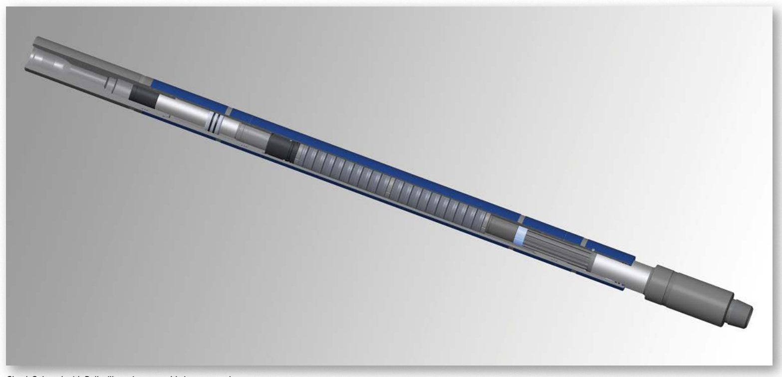
Shock Sub tool with Belleville spring assembly in compression.

During drilling and milling operations, the drill bit imparts various dynamic impact loads to the drillstring. These loads, which are cyclical in nature, can lead to premature failure of the drillstring and rig equipment, low ROP, and hole problems — all translating to a higher cost of drilling per foot.